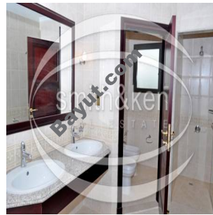
Residences, Palm Jumeirah