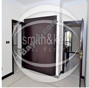
Residences, Palm Jumeirah