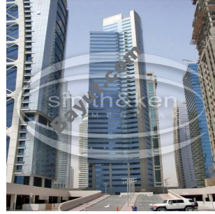
Residences, Palm Jumeirah