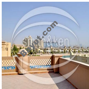
Residences, Palm Jumeirah