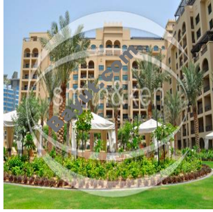
Residences, Palm Jumeirah