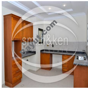
Residences, Palm Jumeirah