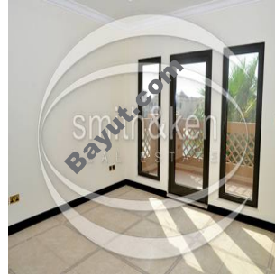
Residences, Palm Jumeirah