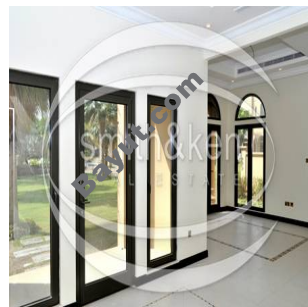
Residences, Palm Jumeirah