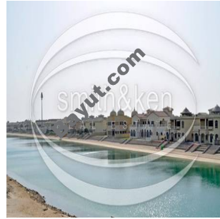
Residences, Palm Jumeirah