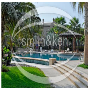
Residences, Palm Jumeirah