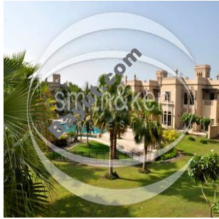
Residences, Palm Jumeirah