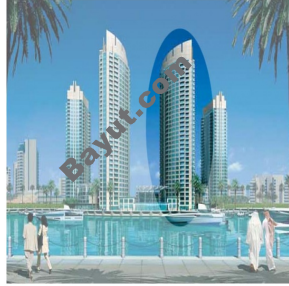
Park Island Bonaire