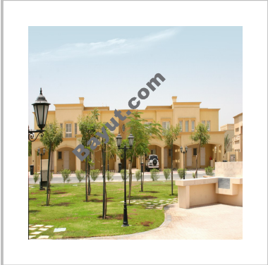
The Springs Exterior view 5