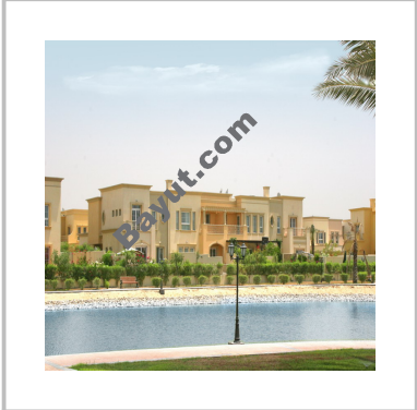
The Springs Exterior view 6