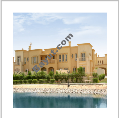
The Springs Exterior view 2