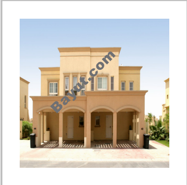
The Springs Exterior view 3