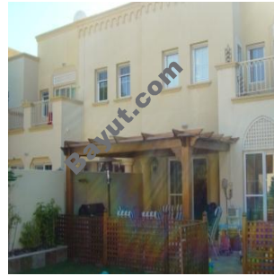
Back of the villa