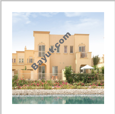
The Springs Exterior view 1