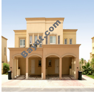
The Springs Exterior view 3