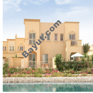
The Springs Exterior view 1