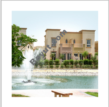
The Springs Exterior view 4