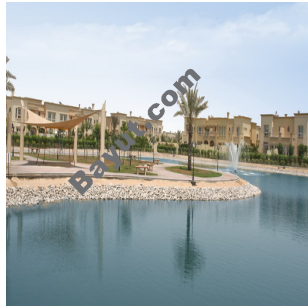
The Springs Exterior view 7