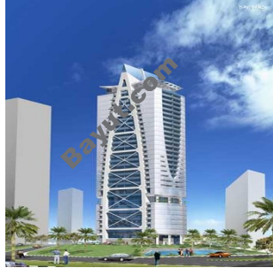
Indigo Tower Exterior View