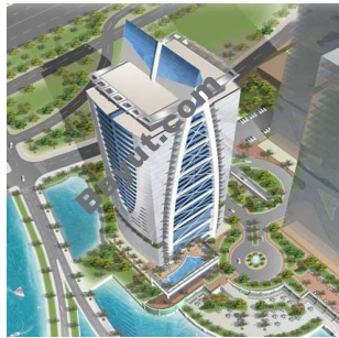
Indigo Tower Exterior View 3