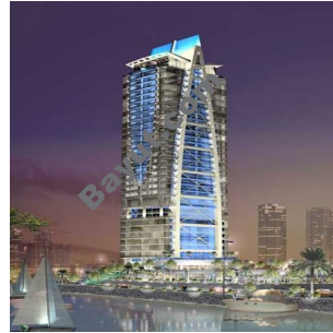
Indigo Tower Exterior View 2