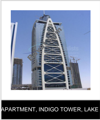
APARTMENT, INDIGO TOWER, LAKE

For larger view click link below http://www.bayut.com/uae_dubai_apartments/indigo_tower_3_beds_apartment_for_sale-517935.html