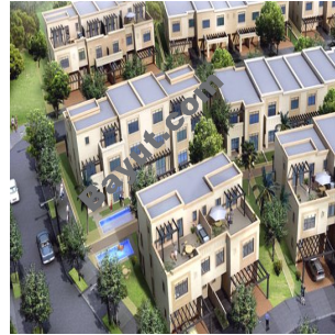
Community View 1