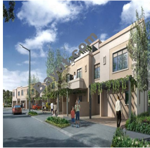
Exterior View 1