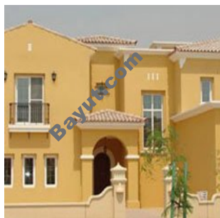
Palmera Arabian Ranches Exterior3