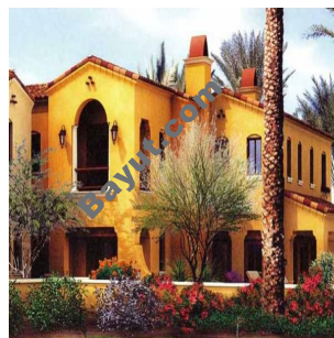
Palmera Arabian Ranches Exterior2