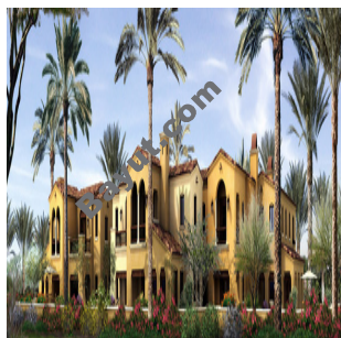
Palmera Arabian Ranches Exterior