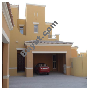
Palmera Arabian Ranches Garage