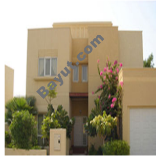
The Meadows Exterior view 2