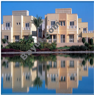
The Meadows Exterior view 1