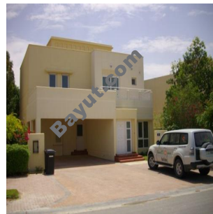
The Meadows Exterior view 4

For larger view click link below http://www.bayut.com/uae_dubai_villas/the_meadows_villa_for_sale-474931.html