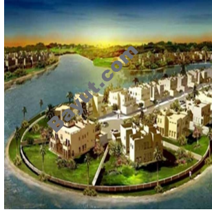
The Meadows Exterior view 3