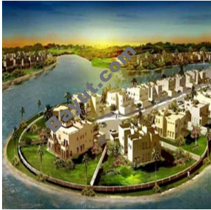
The Meadows Exterior view 3