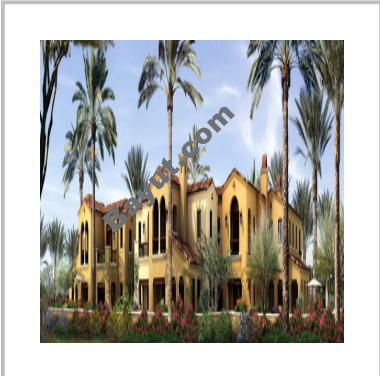
Palmera Arabian Ranches Exterior