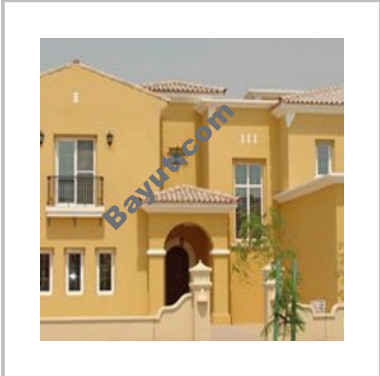
Palmera Arabian Ranches Exterior3