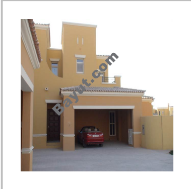
Palmera Arabian Ranches Garage

For larger view click link below http://www.bayut.com/uae_dubai_villas/palmera_villa_for_sale-474928.html