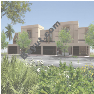
Golf Garden Exterior View 5