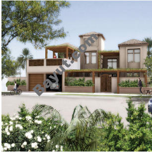
Golf Garden Exterior View