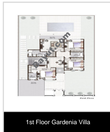
1st Floor Gardenia Villa