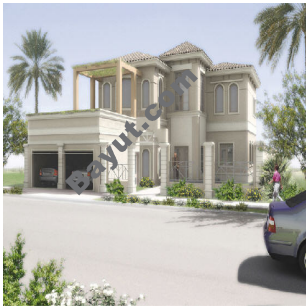
Golf Garden Exterior View 3