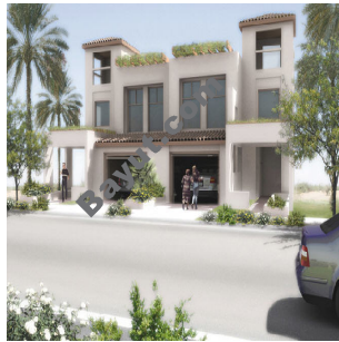
Golf Garden Exterior View 4