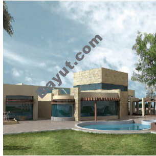
Golf Garden Exterior View 2