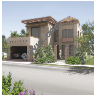
Golf Garden Exterior View 6