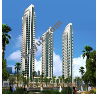
Burj Views Exterior