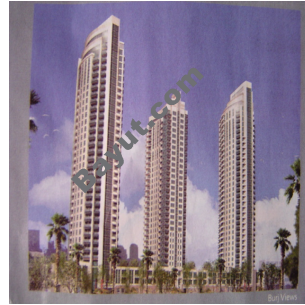
Burj Views Exterior2