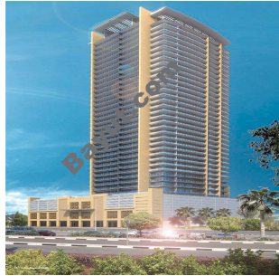
8 Boulevard Walk