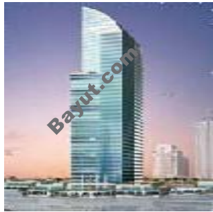
One Lake Plaza Exterior View 2