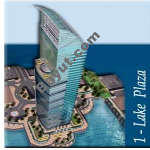
One Lake Plaza Exterior View