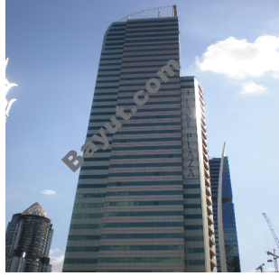
1 Lake Plaza