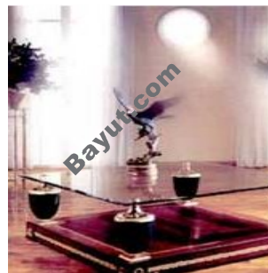
Al Dana 2 Interior View