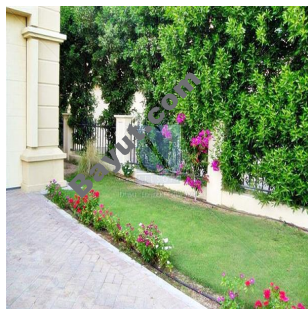
Out Side Area