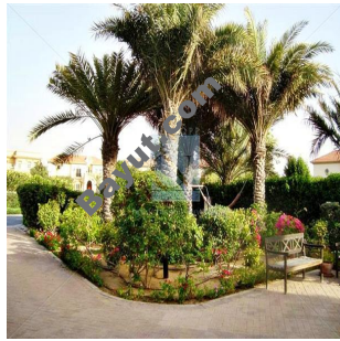
Out Side Area