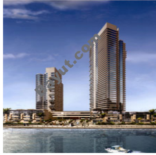
Al Sahab Tower 2 Exterior View 1