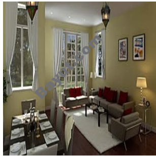
Remraam Interior View 2