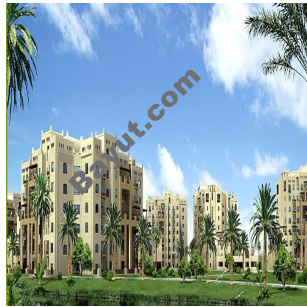
Remraam Exterior View 4