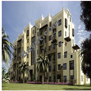
Remraam Phase III