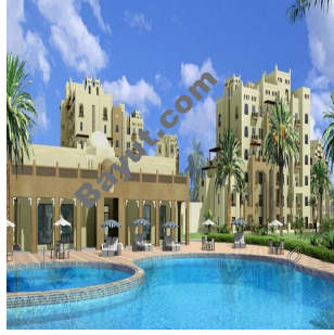
Remraam Swimming Pool