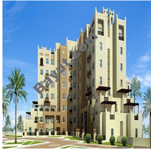
Remraam Exterior View