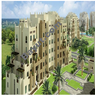
Remraam Exterior View 3