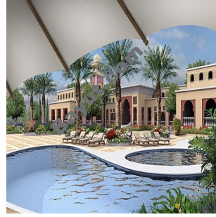
Remraam Swimming Pool 2