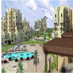
Remraam Exterior View 2