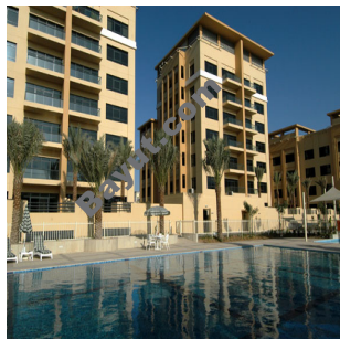
Al Dhafrah Exterior View