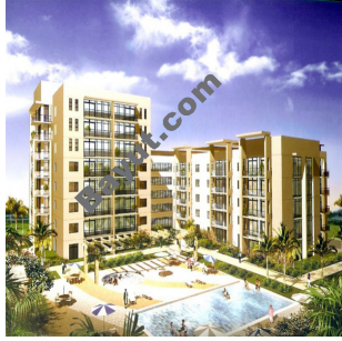
AI Dhafrah Exterior View 2