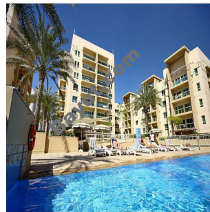
1 BDR, Al Dhafrah 1, Greens for sale ©