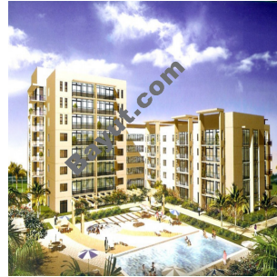
Al Dhafrah Exterior View 2