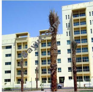
Al Dhafrah Exterior View 3