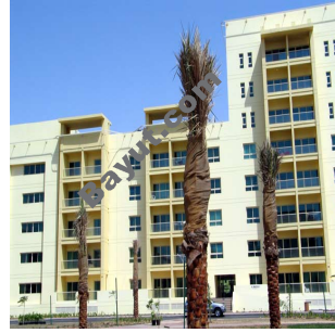
AI Dhafrah Exterior View 3