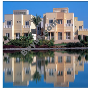
The Meadows Exterior view 1