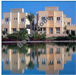
The Meadows Exterior view 1