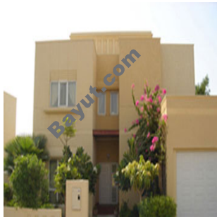
The Meadows Exterior view 2