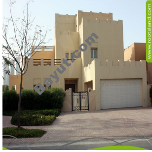
5 Beds Residential villa