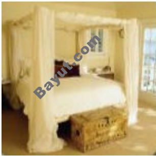
Lake Point Tower Bedroom