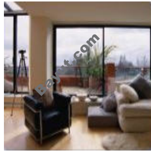
Lake Point Tower Lounge