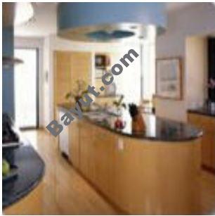
Lake Point Tower Interior View