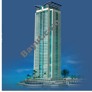
Lake Point Tower Exterior View 1