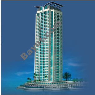
Lake Point Tower Exterior View 1