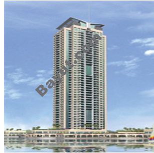
Lake Point Tower Exterior View 2