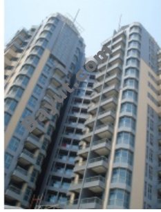
Marina Residence Exterior View 2