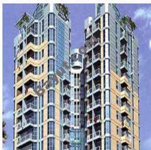
Marina Residence Exterior View