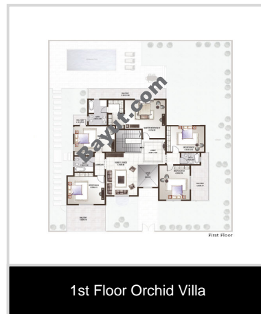
1st Floor Orchid Villa