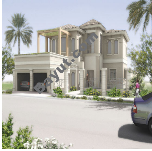
Golf Garden Exterior View 3