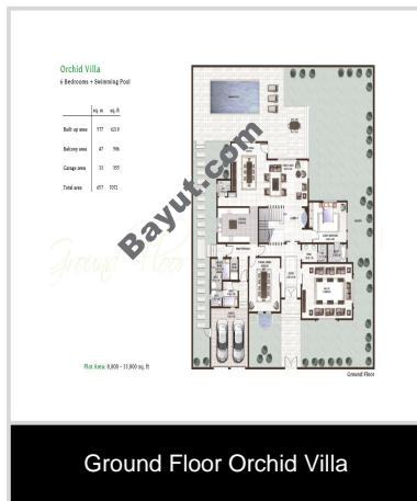
Ground Floor Orchid Villa