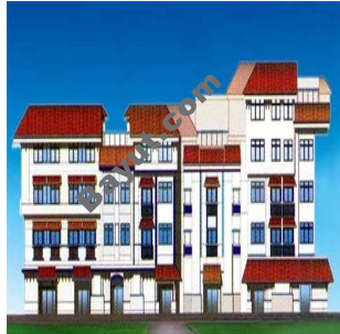
Greece Exterior View