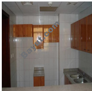
Greece Kitchen View