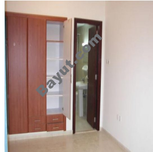
Greece Interior View