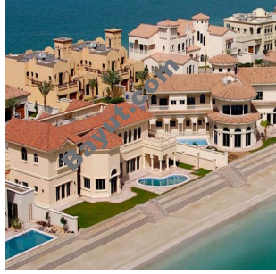
Signature Villa Central Gallery