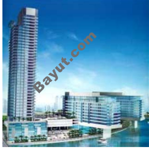
Marina Quays East