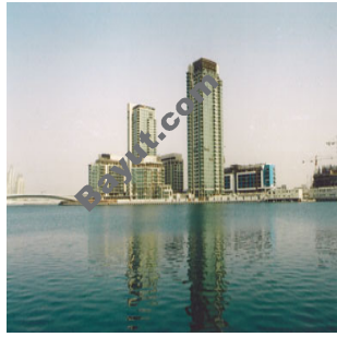
Al Majara 2 Exterior View