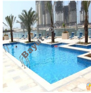
Al Majara 2 Swimming Pool