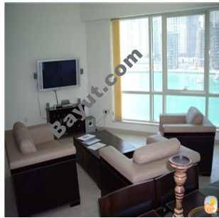
Al Majara 2 Drawing Room