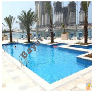
Al Majara 2 Swimming Pool