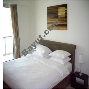
Al Majara 2 Bedroom