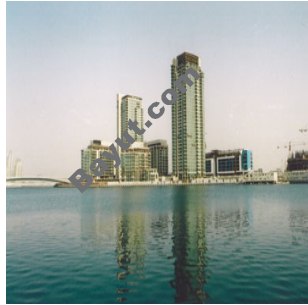
Al Majara 2 Exterior View