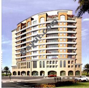
Al Dana 2 Exterior View