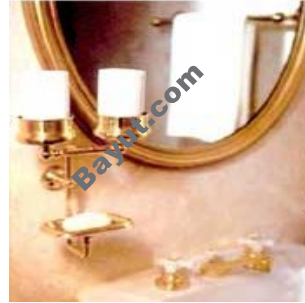
Al Dana 2 Wash Room