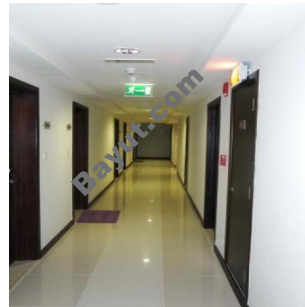
Al Dana 2