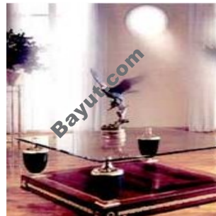
Al Dana 2 Interior View