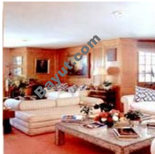
Al Dana 2 Lounge