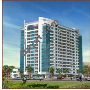
Marina Diamond 2 Exterior View