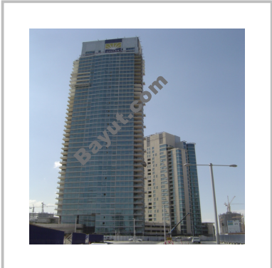
Al Sahab Tower 1 Exterior View 2