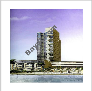
Al Sahab Tower 1 Exterior View 4

For larger view click link below http://www.bayut.com/uae_dubai_apartments/al_sahab_tower_1_apartment_for_rent-469194.html