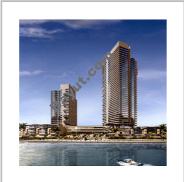
Al Sahab Tower 1 Exterior View 1