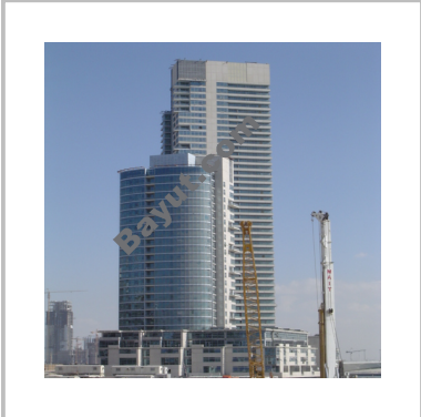
Al Sahab Tower 1 Exterior View 3