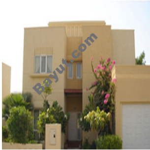
The Meadows Exterior view 2