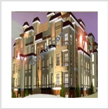
Diamond Views 1 Exterior View