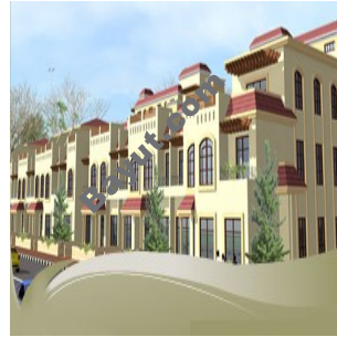
Diamond Views 1 Exterior View 2