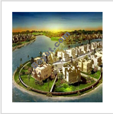
The Meadows Exterior view 3