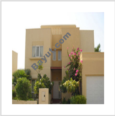
The Meadows Exterior view 2