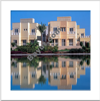
The Meadows Exterior view 1

For larger view click link below http://www.bayut.com/uae_dubai_villas/the_meadows_villa_for_sale-468161.html