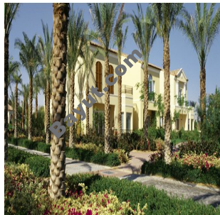
Lake Apartments Exterior View