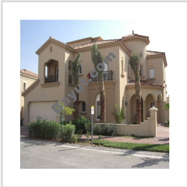
Villa Exterior View