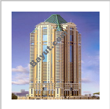
Marina Crown Exterior View 1