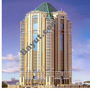
Marina Crown Exterior View 1