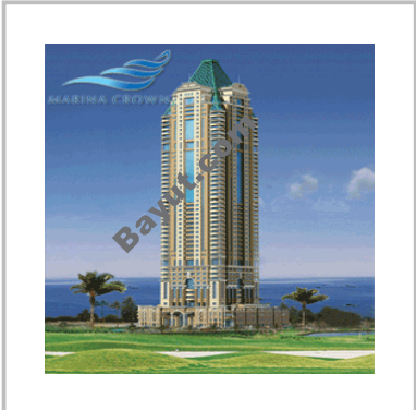
Marina Crown Exterior View 2