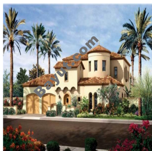
Alvorada Arabian Ranches Exterior