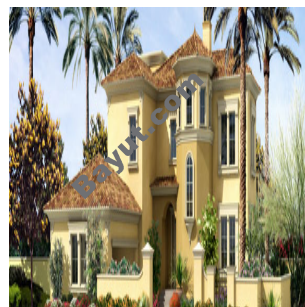
Alvorada Arabian Ranches Exterior2