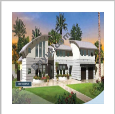
Signature Villa Central Pool Exterior View