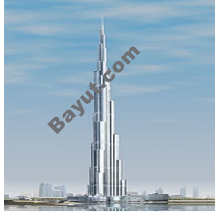
Burj Khalifa (Burj Dubai) Exterior2