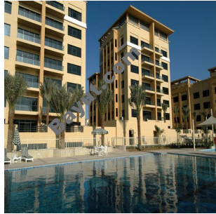
Al Arta Exterior View