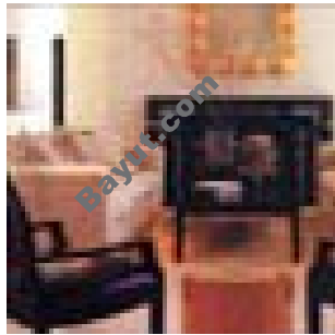
The Icon Interior View 4