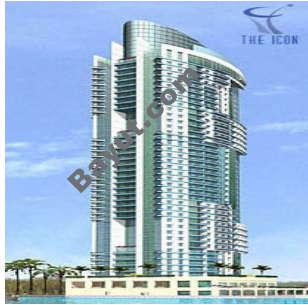
The Icon Exterior View