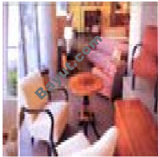
The Icon Interior View 3