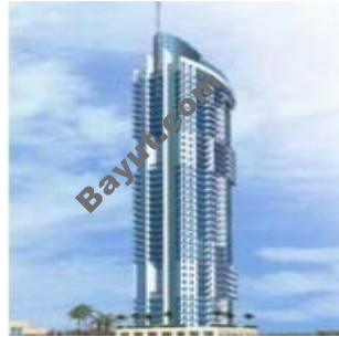
The Icon Exterior View 2