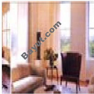
The Icon Interior View 2