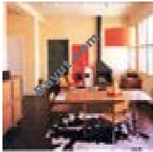
The Icon Interior View