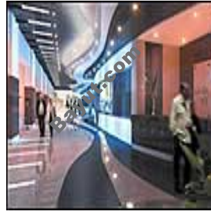
Goldcrest Views 1 Interior View