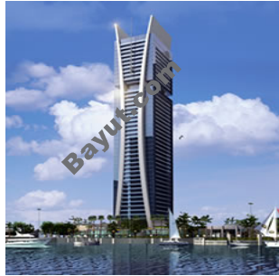
Goldcrest Views 1 Exterior View