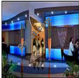
Goldcrest Views 1 Interior View 2