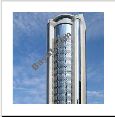
Al Attar Business Tower Exterior View 3