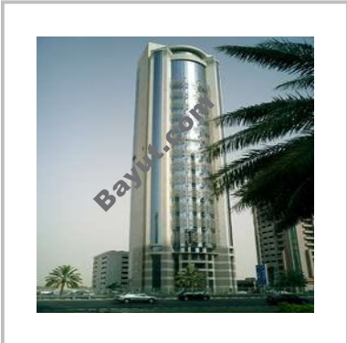
Al Attar Business Tower Exterior View