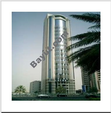
Al Attar Business Tower Exterior View