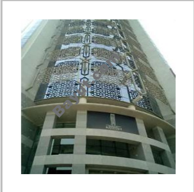
Al Attar Business Tower Exterior View 2