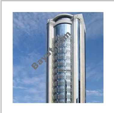
Al Attar Business Tower Exterior View 3