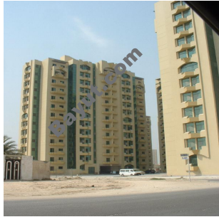
Al Rashidiya Tower exterior