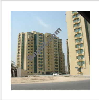
Al Rashidiya Tower exterior