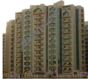
Al Rashidiya Tower exterior1