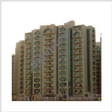
Al Rashidiya Tower exterior1