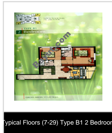
Typical Floors (7-29) Type B1 2 Bedroom