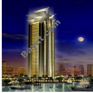
Seef Tower 2 Exterior View