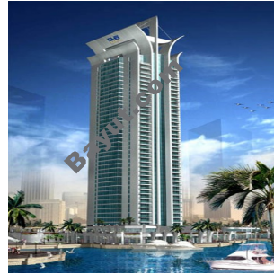
Seef Tower 2 Exterior View2