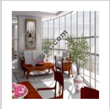
Goldcrest Executive Livingroom