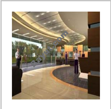
Goldcrest Executive Interior View