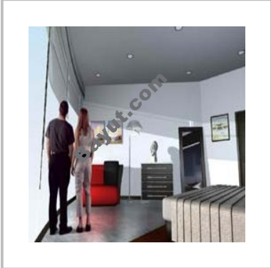
Goldcrest Executive Bedroom

For larger view click link below http://www.bayut.com/uae_dubai_offices/goldcrest_executive_stylish_office_space_for_rent-447494.html