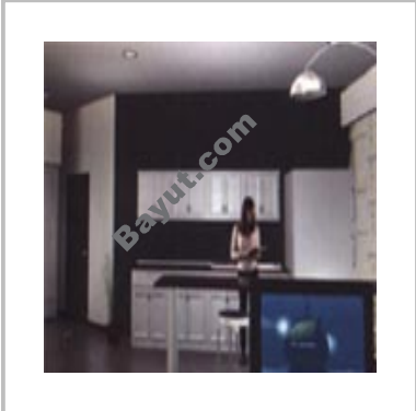
Goldcrest Executive Kitchen