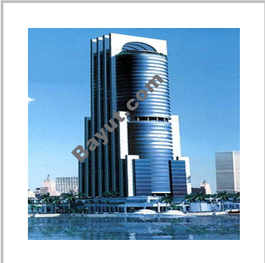
Goldcrest Executive Exterior View