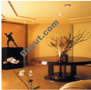
Bonnington Tower Interior View2