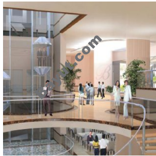
Bonnington Tower Interior View