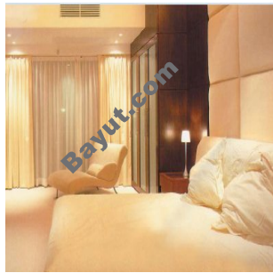
Bonnington Tower Bedroom