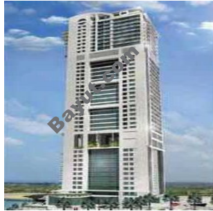
Bonnington Tower Exterior View2