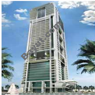
Bonnington Tower Exterior View3