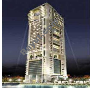
Bonnington Tower Exterior View