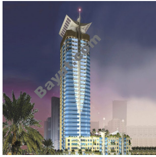
Marina Mansions Exterior View 2