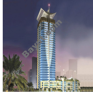
Marina Mansions Exterior View 2