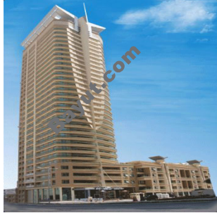
Marina Mansions Exterior View 1