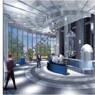
Business Tower Interior