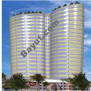
Business Tower Exterior