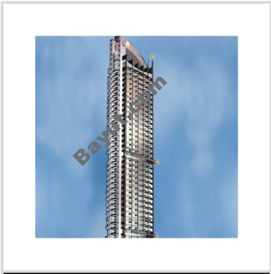
Dubai Star Tower Exterior View 3