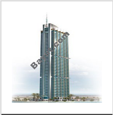
Dubai Star Tower Exterior View 2